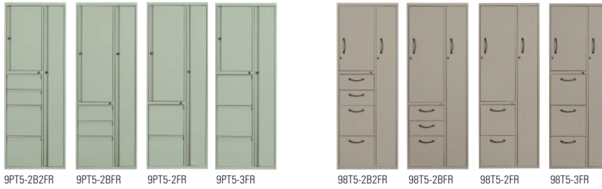
9PT5-2B2FR 9PT5-2BFR 9PT5-2FR 9PT5-3FR